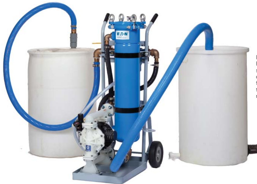
Eaton's FloWash Industrial Filter Cart is a flexible system that operates in-line or as a stand-alone portable filtration system. It is safe to operate and easy to maintain.